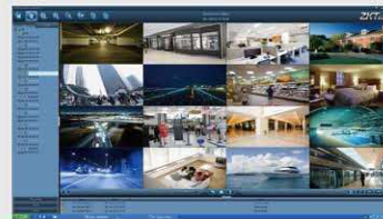
ZKVISION Software(Included in CD)